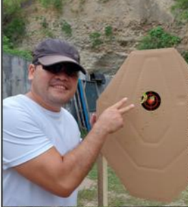
4 bullets 2 hits in 1 hole