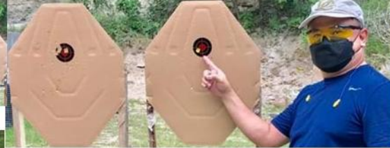
4 bullets 2 hits