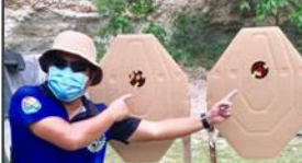
4 bullets - 3 hits