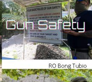
RO Bong Tubio