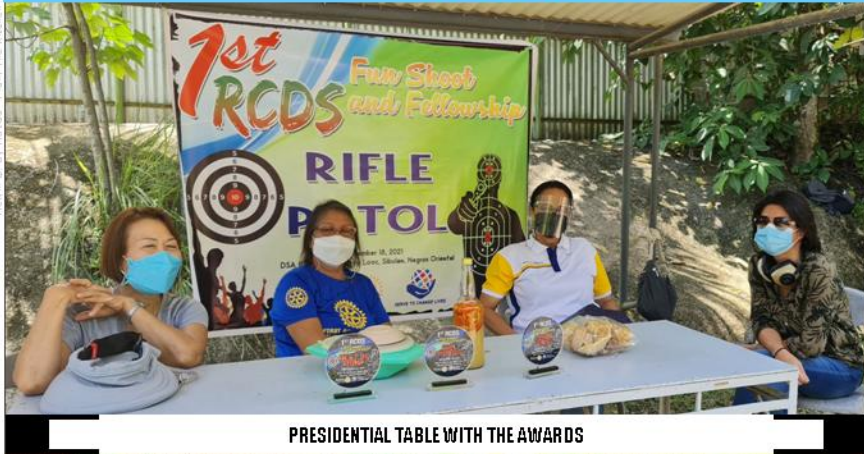
PRESIDENTIAL TABLE WITH THE AWARDS