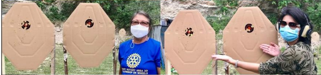
BE (a) WARE